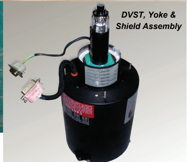
DVST, Yoke & Shield Assembly

Please contact factory for additional systems supported.